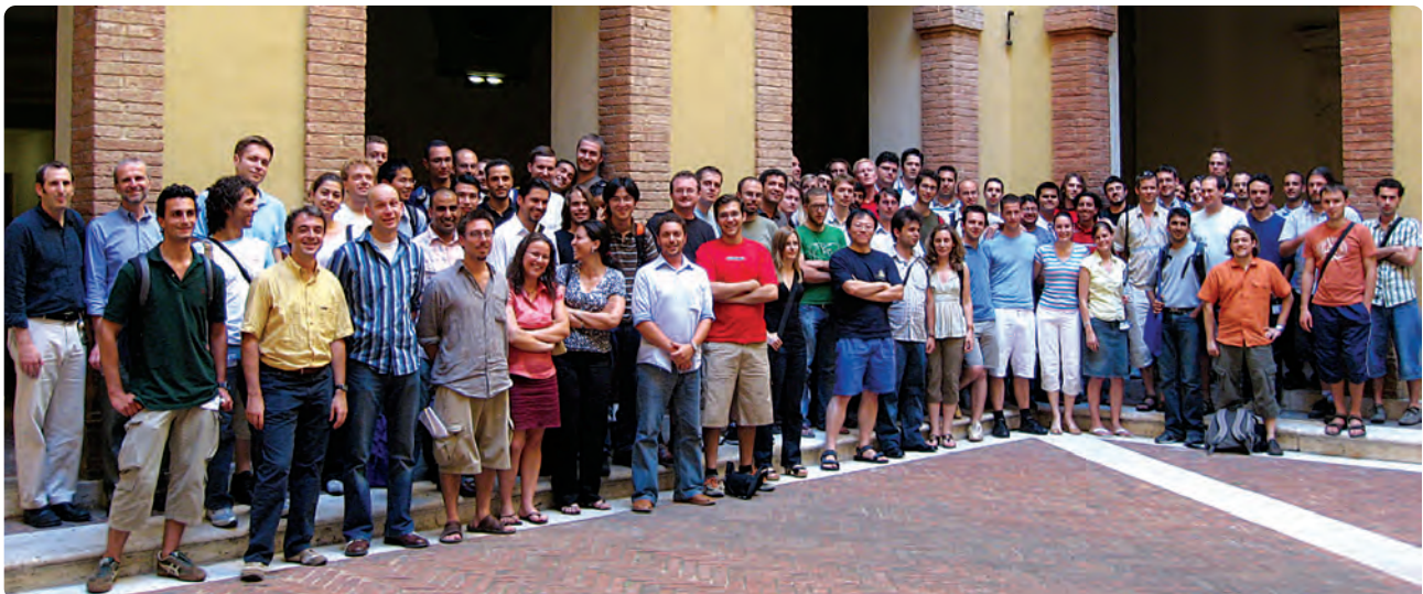
Attendants of the Second HYCON Ph.D. School on Hybrid Systems.