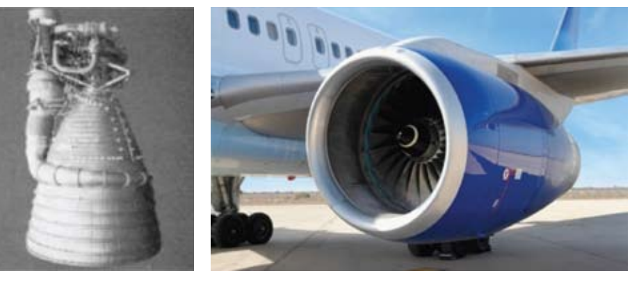
F1 rocket engine

The inherent symmetry of the combustion chamber lends itself to certain natural acoustic modes that are driven into resonance because of the coupling with heat release. Several methods of breaking the symmetry were proven effective in quenching the combustion instabilities.