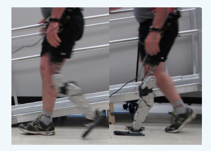
An above-knee amputee testing a virtual constraint controller on the Vanderbilt leg at the Rehabilitation Institute of Chicago