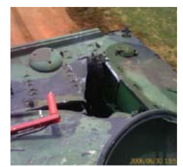
Affordable hit-to-kill accuracy minimizes collateral damage