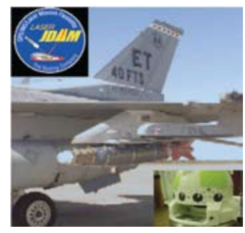
Laser guided MK - 82 scores direct hit against a moving target during tests at Eglin AFB