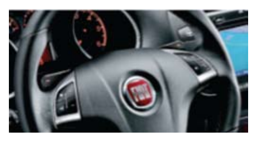
Shift buttons on the steering wheel of a FIAT Bravo

The automated manual transmission (AMT) is an intermediate technological solution between the manual transmission used in Europe and Latin America and the automated transmission popular in North America, Australia, and parts of Asia. The driver, instead of using a gear shift and clutch to change gears, presses a + or - button and the system automatically disengages the clutch, changes the gear, and engages the clutch again while modulating the throttle; the driver can also choose a fully automated mode. AMT is an add-on solution on classical manual transmission systems, with control technology helping to guarantee performance and ease of use.